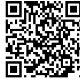
Waltham UU Facebook Page

Stay connected on our Website, Facebook Page, or on Instagram! Like and follow us to get updates and news!