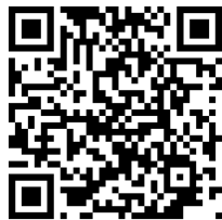
Waltham UU Facebook Page