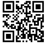
Waltham UU Webpage

If you have not yet become a member, would you consider the key role in our future you too could play? Finances should never be a reason not to become a member, because your status is not dependent on what you can give.